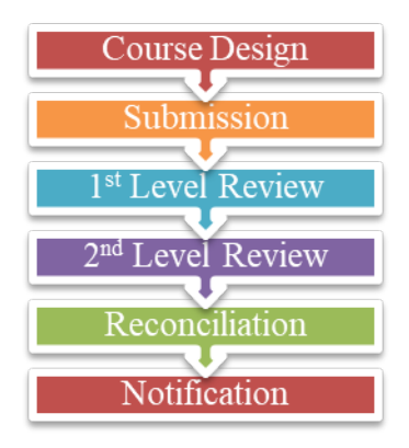
Figure 1: Annual Review Process

CCCs submit new or revised course outlines of record (COR) to the CSU and UC system offices electronically via ASSIST. CORs must be approved by the college through the local curriculum approval process. Intersegmental faculty and staff then evaluate the outlines for alignment with CSU GE Breadth Requirements and IGETC Standards. CCCs are responsible for submitting accurate and current course outlines. If a course has a decrease in units or has changed substantially since its last review, a CCC should select "Substantial Change" during the course submission process. (For a description of what counts as a "substantial change", see Submission section, below.)