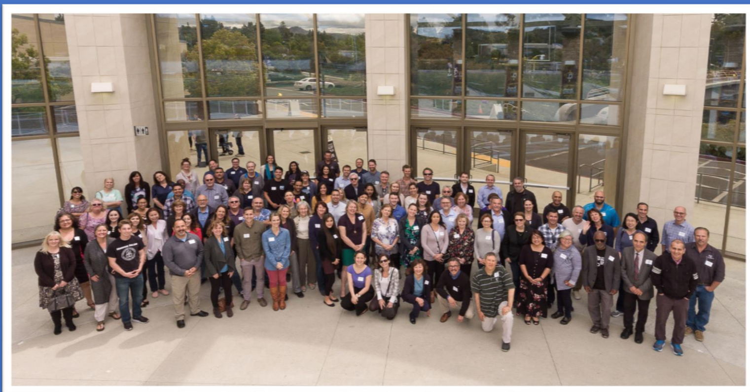
Photograph from Spring 2019 Strategic Planning Retreat