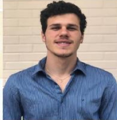
Junior – Mon/Tue/Thurs 3-4

I am a Mathematics Major and I am very excited to be working with all of you! I am a firm believer in Growth Mindset. I can't wait to work with you on all types of problems, as well as come up with strategies for homework and tests! Math can seem very dull at first but I like to put the FUN in functions! Looking forward to working with everyone!